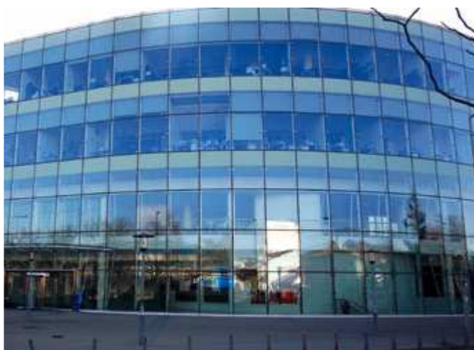
Venue: Auditorium of the Research Centre, Prilaz baruna Filipovića 25, Zagreb

Vončinina 2/1, 10000 ZAGREB ID-HR-AB-01-080416772; IATA 75-3 2121 2 Tel. +385 1 461 65 98; 466 37 52 Fax. +385 1 466 37 52 E-mail: tiptours@tiptours.hr