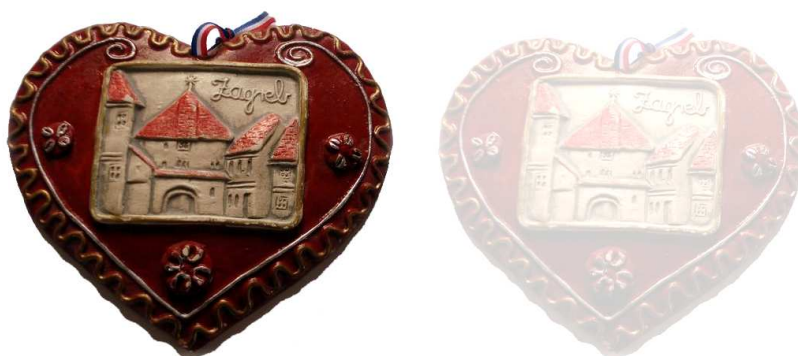
Licitar Heart from Zagreb

Conference's token: The licitar heart, originally named Licitarsko Srce, an age-old Croatian tradition, is a uniquely decorated cake made of honey-dough and is symbol of love in Croatia. The humble licitar heart gets the door to one's heart open, softens the soul and brings emotions to the surface. The warmth and affection such a gift shows to our friends make them even more supportive and caring. And finally, those very hearts convert the cry of our ancestors into happiness for keeping their memory alive.